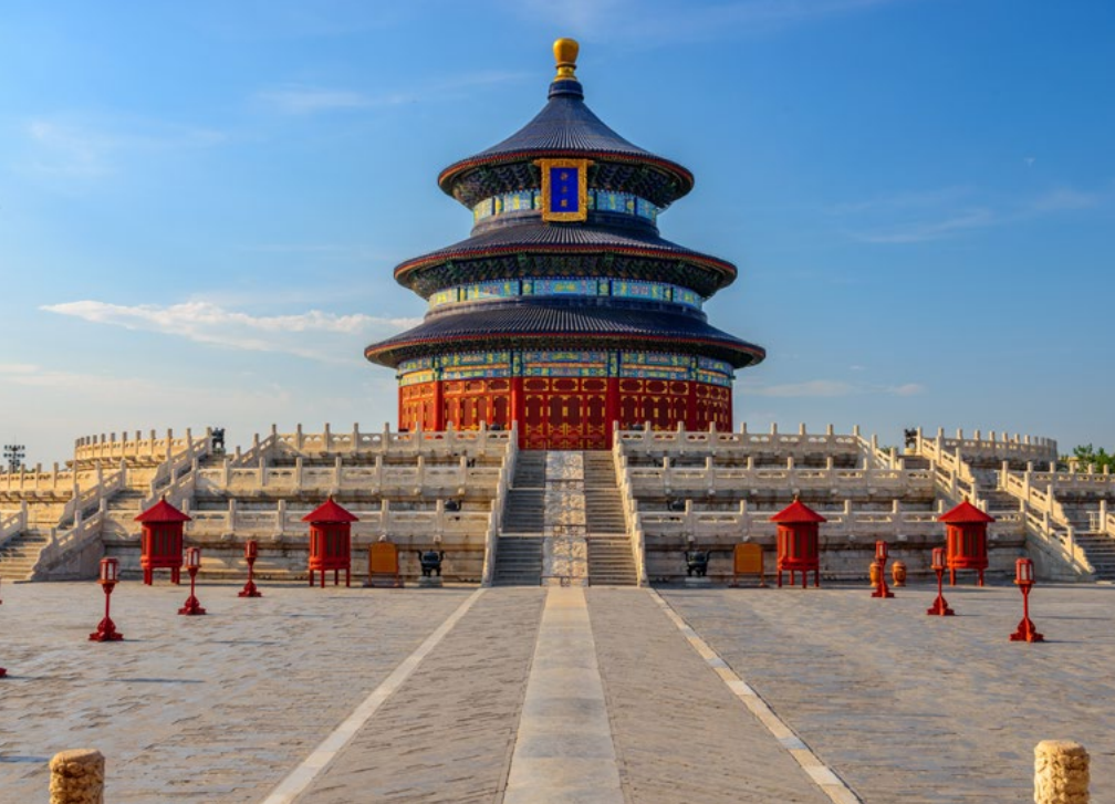
Beijing, China at the historic Temple of Heaven in the afternoon.

“Within a mere 80 years, children encounter imperial decline, revolution, nationalism and the rise of communism—making this period a goldmine for scholarship preparation.”